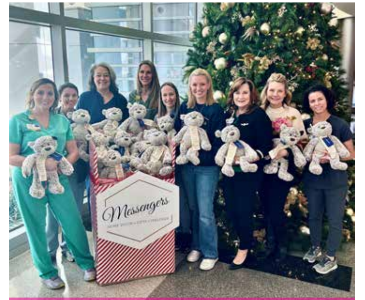
Messengers Gifts donated 500 Giving Bears during the holiday season for the babies in the Woman's NICU.

Your contributions have a meaningful impact.