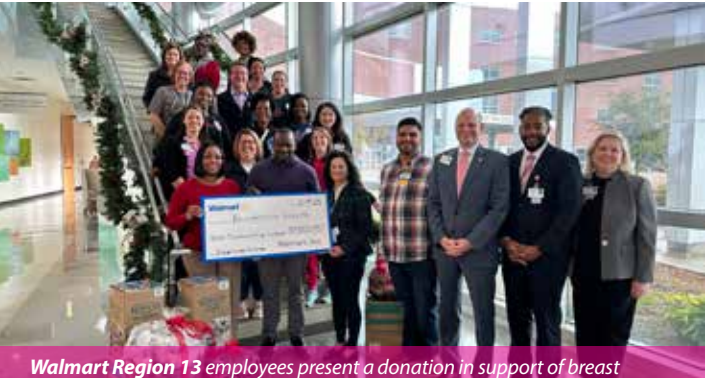
Walmart Region 13 employees present a donation in support of breast cancer services at Woman's. Their team also presented numerous patient support items to the Woman's Social Services team.