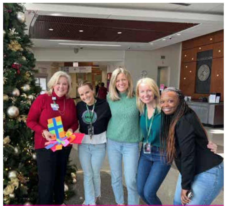
BASIS Baton Rouge teachers delivered handmade "kindness cards" designed by their students to bring cheer to patients during the holiday season.

You can get involved and support Woman's. To host a fundraising event or join an event committee, email giving@womans.org .