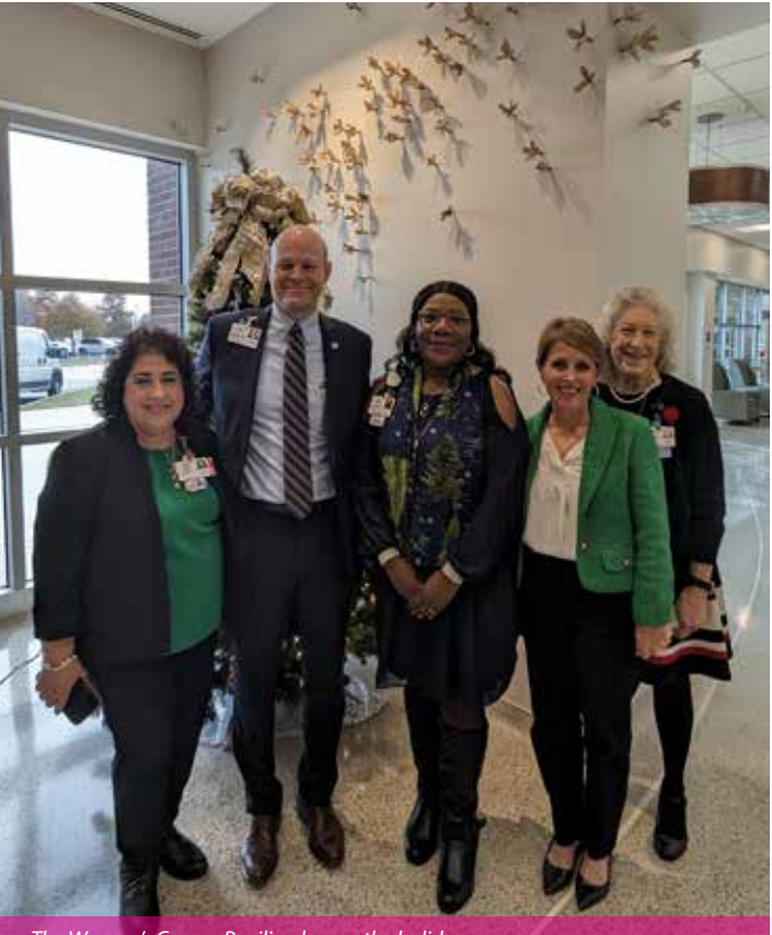
The Woman's Cancer Pavilion began the holiday season with its annual Christmas tree lighting.

You can get involved and support Woman's. To host a fundraising event or join an event committee, email giving@womans.org .