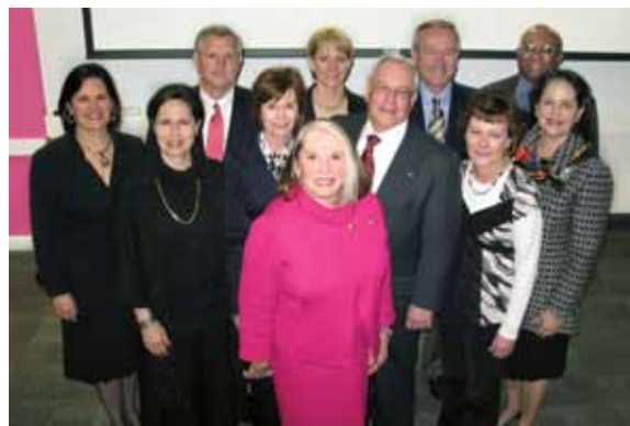
Annual Giving Campaign Cabinet.