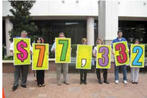
At the Grand Finale, hospital leadership reveal the amount raised at that point by employee donations.