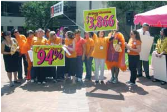
Employee Giving Campaign's winning team, X-ray Woman, solicited the highest number of employee donors.