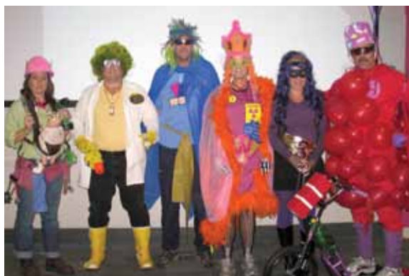
Team Superheroes are introduced during the Employee Campaign.