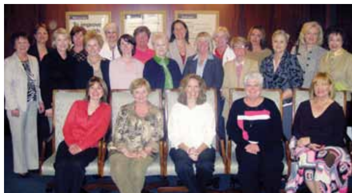
2010 Woman's Victory Open Committee.