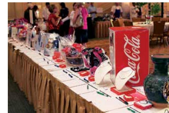
Pink on the Plaza Silent Auction