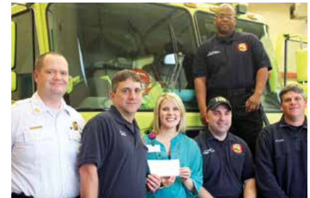
St. George Firefighters