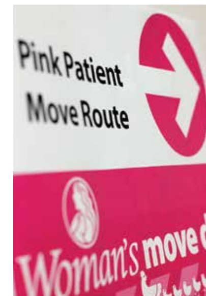
Woman's safely moved 121 patients in 10 hours to the new campus.