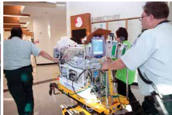
NICU patients being transported to the new hospital