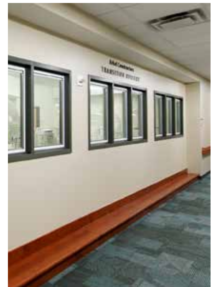
Transition Nursery named in appreciation of Arkel Constructors