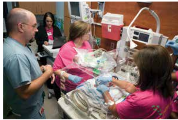
NICU patients settle in at the new hospital