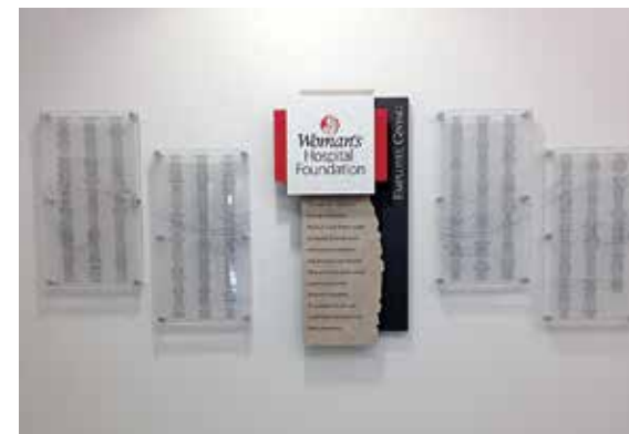
Employee Giving Donor Recognition Wall