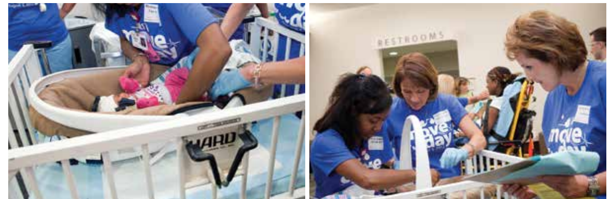
Receiving newborns at the new campus