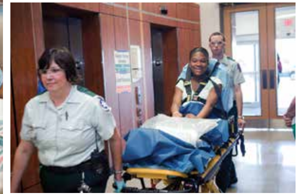
Patients being transported to the new hospital