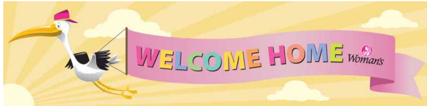
Employee Giving Campaign logo

Employee Giving Campaign. The Employee Campaign gives all hospital employees the opportunity to make a charitable contribution to the hospital. More than 100 hospital employees were involved in planning, organizing, and implementing this philanthropic effort to raise funds to support the Employee Emergency Fund as well as to help fund a number of programs and services meeting critical community needs. With 49% participation from employees, the campaign raised over $100,000.