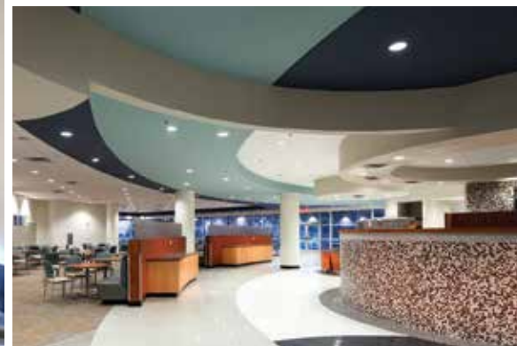
Woman's Way Café