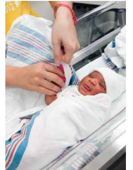
A newborn being swaddled for the move