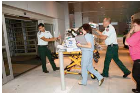
Newborns enter the new campus