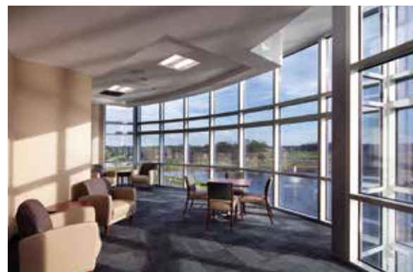
Family lounges at the end of each pod