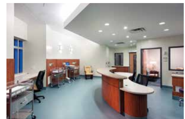
Newborn Nursery named in appreciation of All Star Dealership Properties, LLC