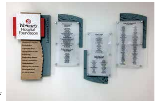
Annual Giving Leadership Donor Recognition Wall