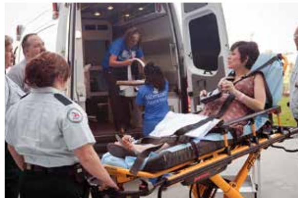
A patient arrives at the new hospital with her newborn.