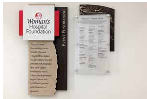
Donor Recognition Wall

2012 Woman's Victory Open. The 14th Annual Woman's Victory Open, netted more than $145,000 to benefit the breast cancer outreach and education programs of Woman's Hospital.