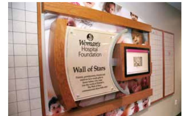
New Campus Wall of Stars