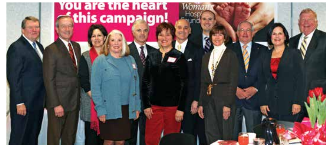
Annual Giving Campaign Committee