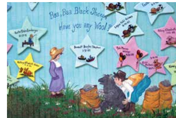
Goodwood Campus Hall of Stars