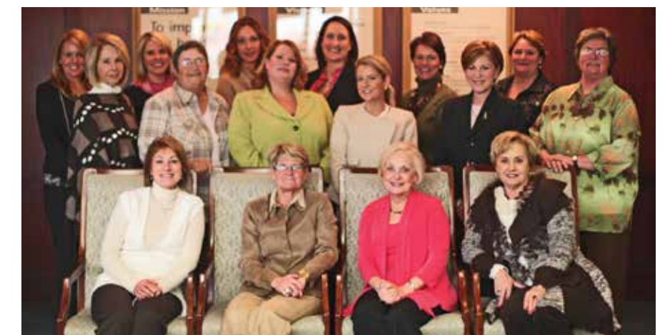
WVO Planning Committee