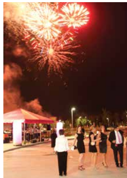
Light up the Night celebration at Woman's