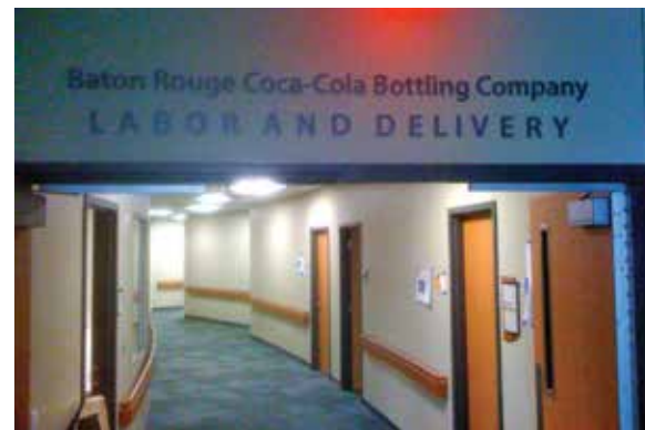
Labor and Delivery unit named in appreciation of Baton Rouge Coca-Cola Bottling Company