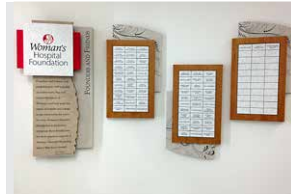
Founders & Friends Donor Recognition Wall

Founders and Friends was established in 1999 to build an endowment to support Woman's Hospital and its ability for generations to come to improve the health of women and infants. It is comprised of individuals who have made or have notified Woman's Hospital of their intent to make a planned gift through their estate plans. Donors who have made outright gifts of $10,000+ to the endowment are also recognized as Founders and Friends.