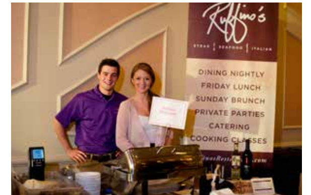
Chef's Showcase at Pink on the Plaza