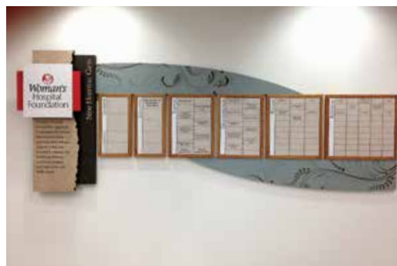
New Campus Donor Recognition Wall