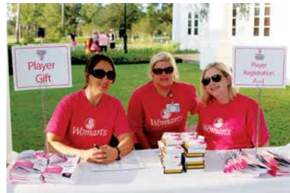
Employee volunteers at WVO