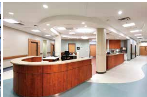
Nurses' station in each pod