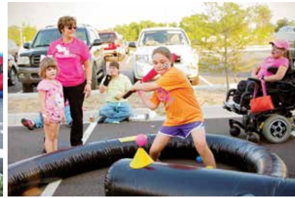
Family games at the Employee Pinknic