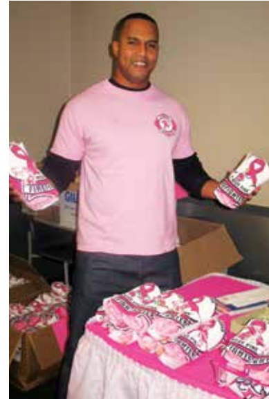
A St. George firefighter wears pink to sell t-shirts in the hospital cafeteria to help raise money for Woman's during Breast Cancer Awareness month in October.