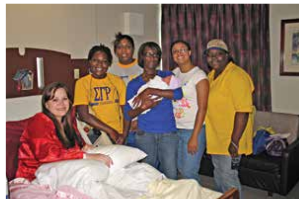
Members of the Beta Alpha Chapter of Sigma Gamma Rho sorority donate a gift basket to the first baby girl born at Woman's on their Founder's Day, November 12.