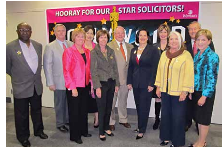
2011 Annual Giving Campaign Cabinet