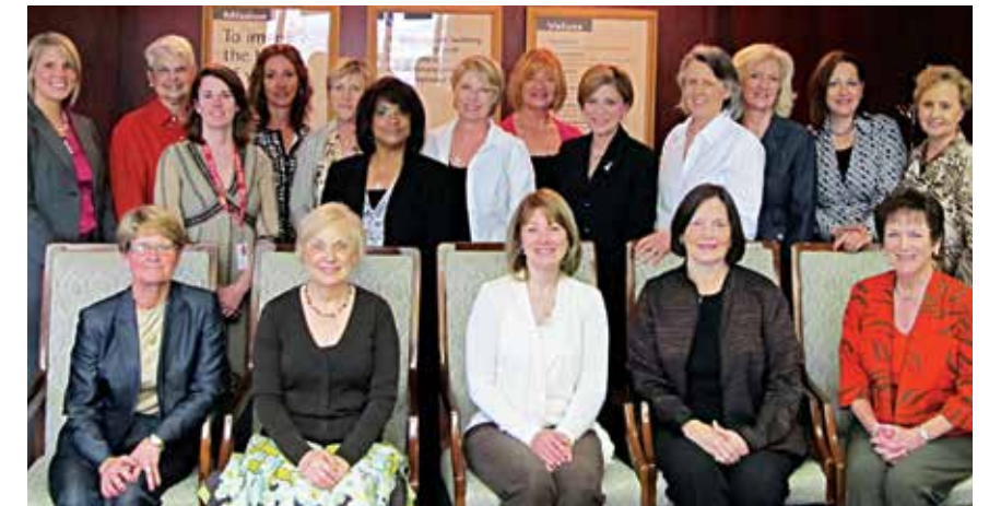
2011 Woman's Victory Open Committee