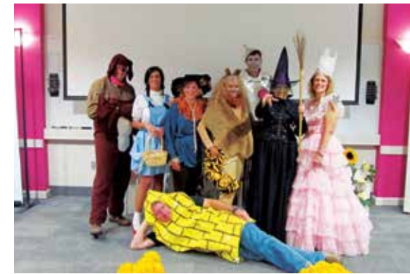
Costumed vice-presidents kick-off the Employee Giving Campaign, "There's No Place Like Woman's."