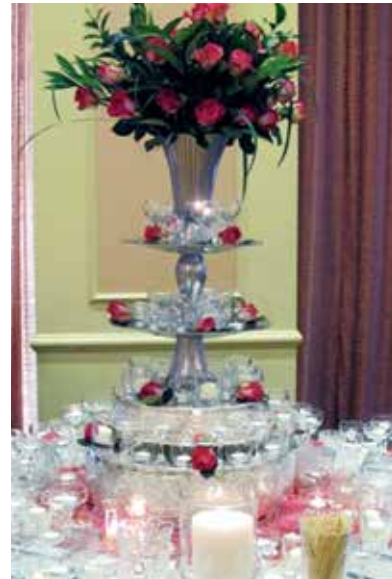
Lighted candles at Pink on the Plaza honor all who have fought the battle with breast cancer.