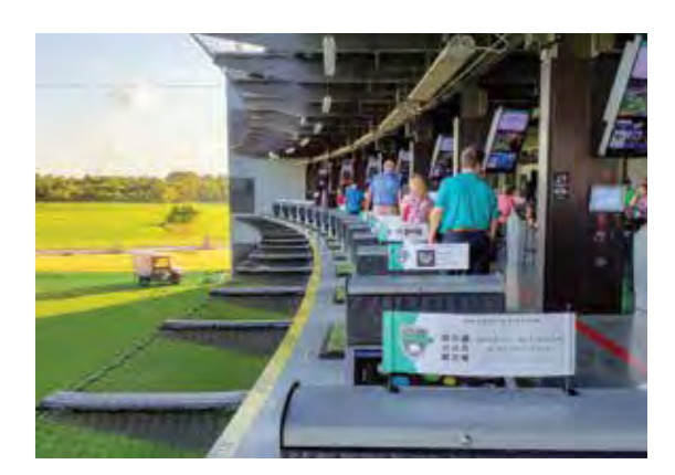
The 21st Annual Woman's Victory Open was held at its new location, TOPGOLF. The $80,000 raised will support local women diagnosed with breast or gynecologic cancer throughout their cancer journey. Since 1999, this event has raised over $3,000,000.