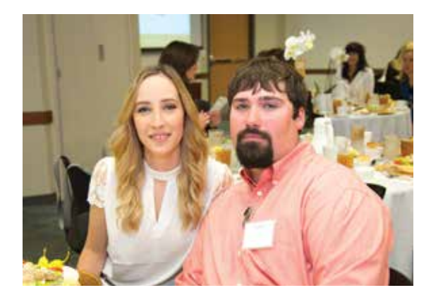
Woman's Impact Luncheon is an opportunity for members of the community to learn about the programs and services supported by philanthropy at Woman's. This year's event featured a patient testimonial from a NICU family whose story of courage and loss was softened by the extraordinary efforts of Woman's palliative care team. The event raised nearly $150,000 to support families in our community.