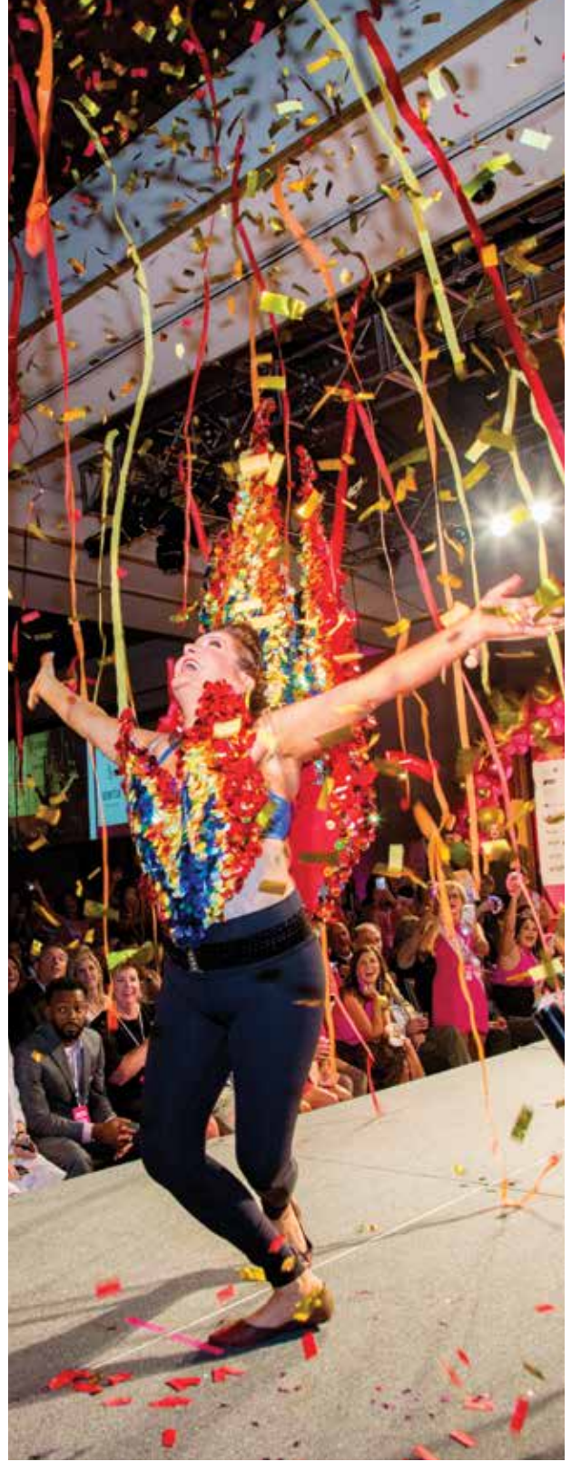
BUST Breast Cancer is a unique celebration that showcases bra art to raise funds and awareness for breast cancer. At this year's event, more than 1,200 guests enjoyed tastings from local restaurants and chefs, live and silent auctions, and a fashion show featuring 26 breast cancer survivors taking the stage in bras designed by local artists. This year's party raised a record $353,000.