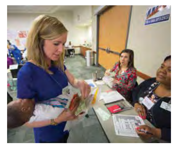
Woman's has hosted multiple poverty simulations which allow participants to gain a better understanding of the real-life struggles patients endure living below the poverty line. The poverty simulation is funded by United Health Foundation's three-year, $1.2 million grant.