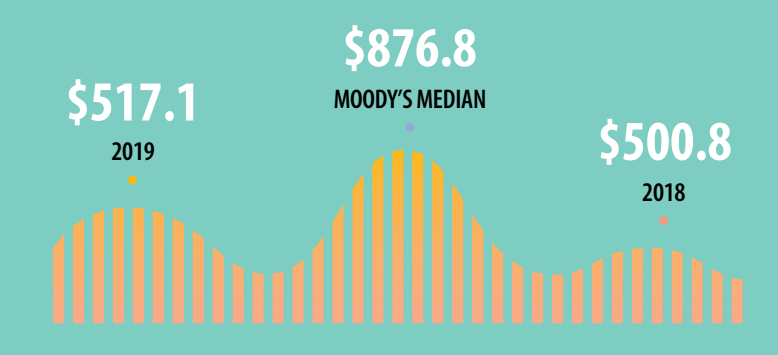
Total Assets (in millions)