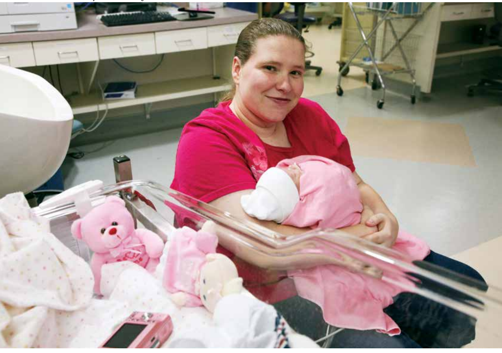
A large percentage of infants discharged from CNIC are cared for at home by Woman's Home Care.