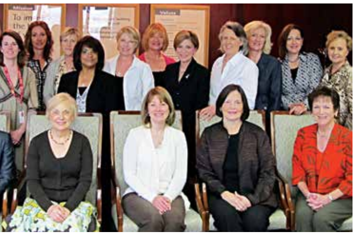
2011 Woman's Victory Open Committee